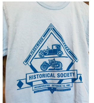
NEW T-SHIRTS AVAILABLE

We again manned a booth at the Fleetwood Community Carnival. We had, and still have, additional copies of the 2023 Photo book available as well as new Society T-shirts. Thanks to